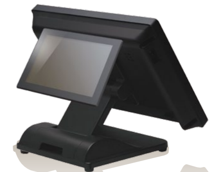
2nd LCD Display